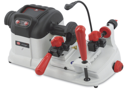
TR-3050 IMAGE S