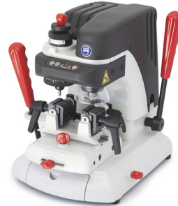
TR-2050 PANTHER SX