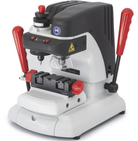
TR-2050 PANTHER S